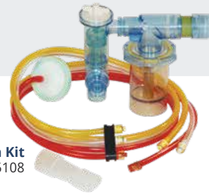
Phasitron Kit A55108