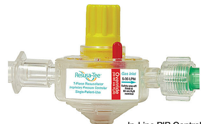
In-Line PIP Controller with Override Button

New Resusa-Tee T-Piece Resuscitator with Built-In, Color-Coded Manometer 0 - 60 cm H 2 O and Adjustable PIP Controller with Override Button