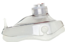
Small Adult Size 4