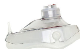
Adult Size 5