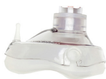
Child Size 3

Mercury Medical's Reusable Anatomical Silicone Face Masks are anatomically contoured to conform to natural facial profiles allowing for a secure, low pressure seal.